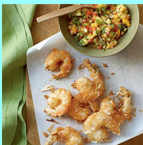
Seafood Recipe of the Month

At last count there were 66 women registered to participate in the May 1st & 2nd event. The ladies will have the opportunity to learn various outdoor activities. The event is being held at The Lodge, located at 3620 FM 1069. A Saturday evening mixer will take place at Poorman's. Throughout the weekend we will be snapping photos of all the fun taking place - and these photos will be available to purchase/order at the mixer.